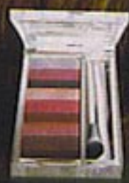
Custom color for hazel eyes

Create evening eyes fast with these ingenious new products: the Physicians Formula Shimmer Strips Custom Eye Enhancing Shadow and Liner palette ($10; at drugstores), left, contains nine shades to flatter brown, hazel, blue, or green eyes; ColorOn Professional Instant Eye Shadow applicators ($30 for 20; coloronpro.com ) provide single doses of mineral-based shadow; and Laura Mercier Faux Lashes ($18; sephora.com ) are tinted black at the base—no liner necessary.